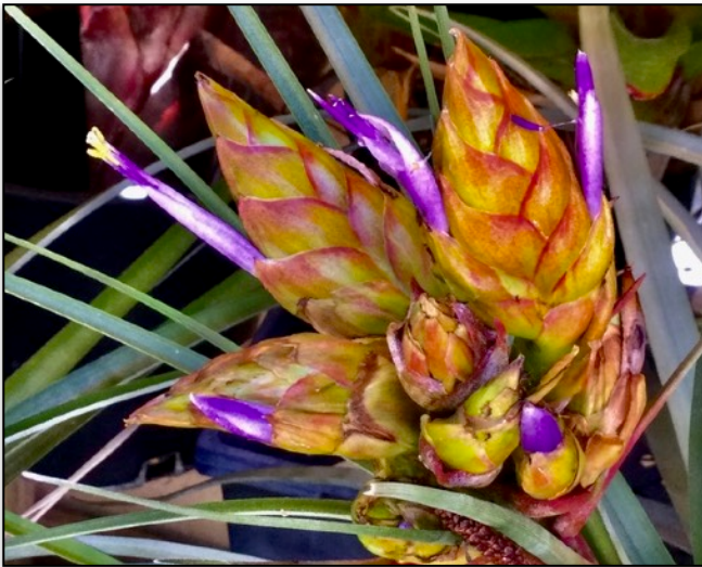
Tillandsia compressa.